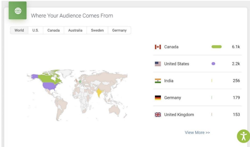
Figure 2: GradCast’s worldwide reach.